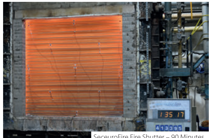
SeceuroFire Fire Shutter – 90 Minutes