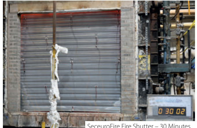
SeceuroFire Fire Shutter – 30 Minutes

The SeceuroFire Fire Shutters were tested and assessed by Warringtonfire. The product is fitted on the furnace side replicating the most severe condition and the temperature of the furnace is increased to 1200°C at a rate defined by the product standards.